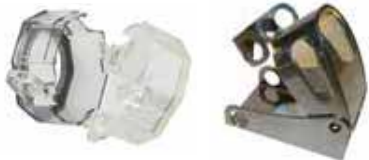
Push Button Cover NEMA 30.5 mm (PBL6) Push Button Cover IEC 22.5mm (PBL8)