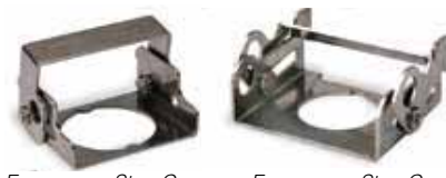
Emergency Stop Cover NEMA 30.5mm (PBL2) Emergency Stop Cover IEC 22.5mm (PBL4)